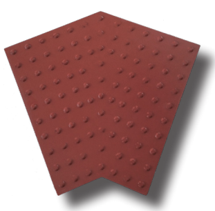
The 45° wedge design can be used as a transition between TekWay's standard 24 inch tiles.

The radius tiles are produced in 24 inch and 36 inch depths, with a radius of 10 feet to 60 feet. Domes are tapered to match the radius so that the ADA dome spacing remains compliant. The uniqueness of this tile provides the flexibility to be incorporated into any radial planning or design.