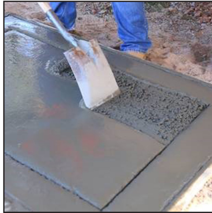
Step 2: Preparation of Wet-Set (Fresh Concrete) for Dome-Tiles