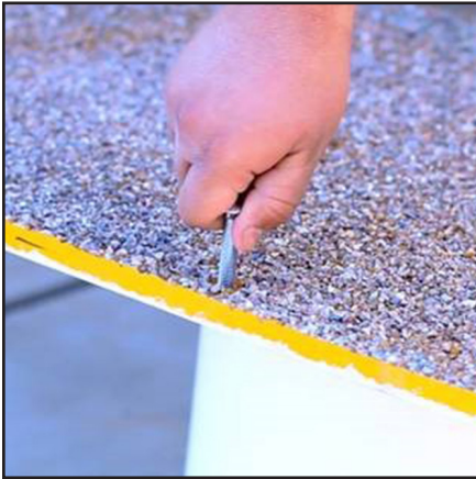
Step 1: Preparation of Dome-Tiles and Mortar mix