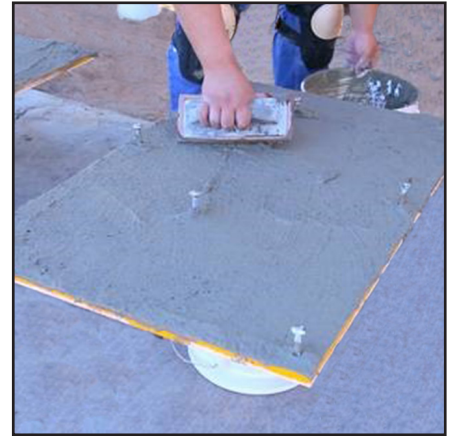
Step 3: Prepare Dome-Tiles for Installation