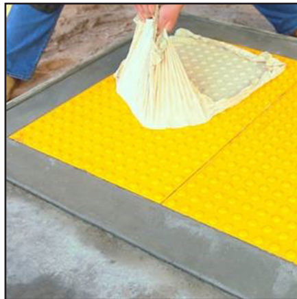
Removing Protective Covering (If applicable)