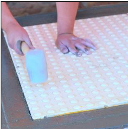
Step 4: Installing Dome-Tile into Wet-Set (Fresh Concrete)