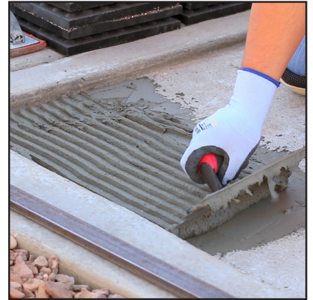
Step 3: Installing Thin-Set mortar into the substrate