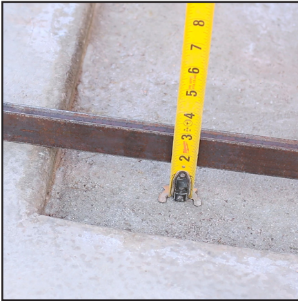
Step 1: Preparing The Site for installation