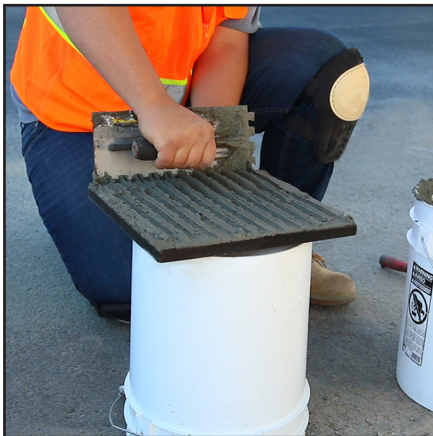
Step 4: Installing Dome-Tile into Thin-Set mortar